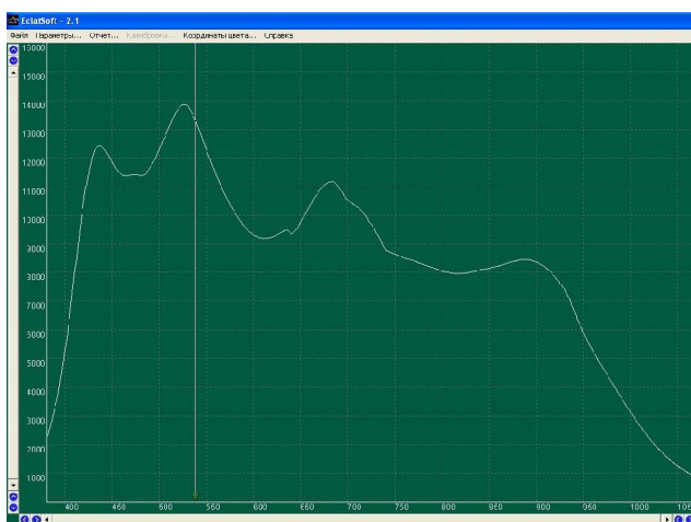
Fig. 1. View of the signal in 380-1700 nm range.

The spectral control system shall be designed to compensate the intrinsic noise of diode arrays and simultaneously provide high baseline stability. With SCS, satisfying these requirements in a complex, one can obtain reliable spectral data on the growing thin film.